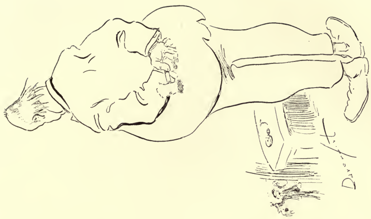
THREE MINUTES WITH THE SPEAKER